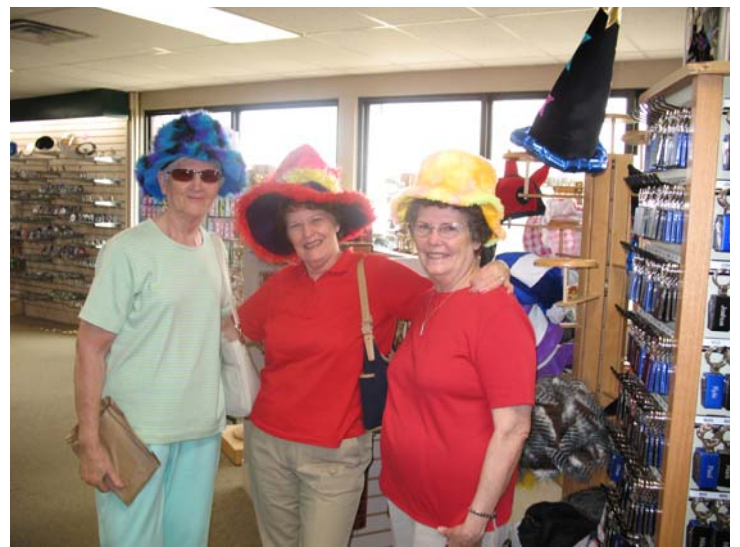
Three of our beauties modeling their new hats!

Our November campout will be at Lincoln Parish Park near Ruston starting on the 15 th . If you remember the last time we were there we had an old fashion weenie roast. I think we should do it again. Someone needs to volunteer to bring some firewood – just a few sticks will be sufficient. We can purchase the weenies and trimmings after we get there.